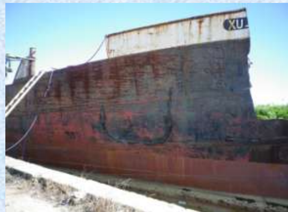
Pollux Ship (web recyship)

and “Pollux” (in the summer of 2013, coming from Portugal).